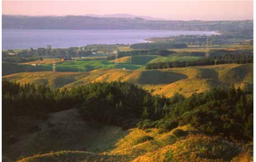
The major cause of lake water quality problems in the Rotorua lakes is excessive nitrogen and phosphorus from land use activities in the lake catchments.

The new landowners should be made aware of the nutrient benchmark, and that any land use change or land management practices will have to remain within that nutrient benchmark.