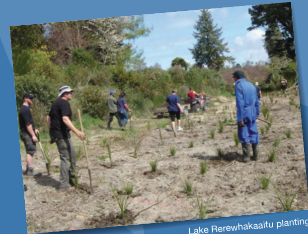
Lake Rerewhakaaitu planting