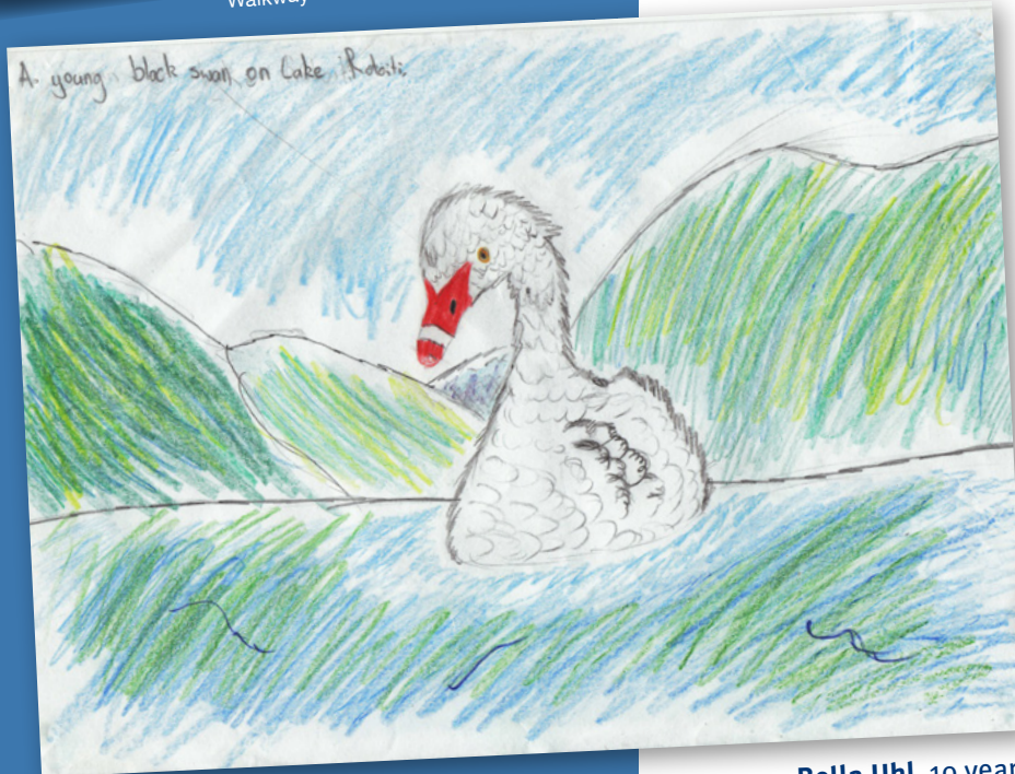
Bella Uhl 10 years