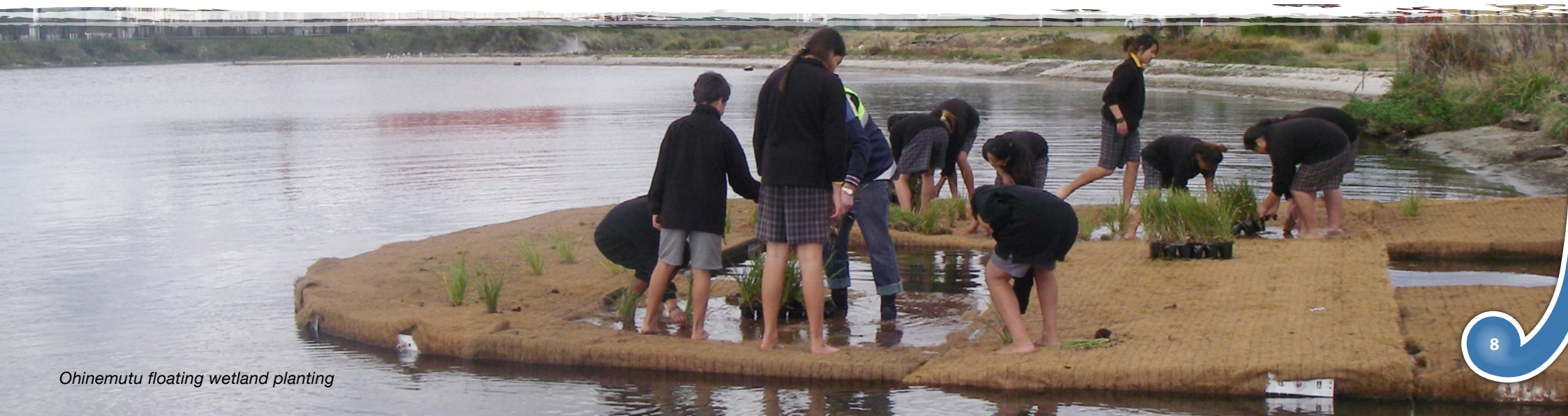
Ohinemutu floating wetland planting