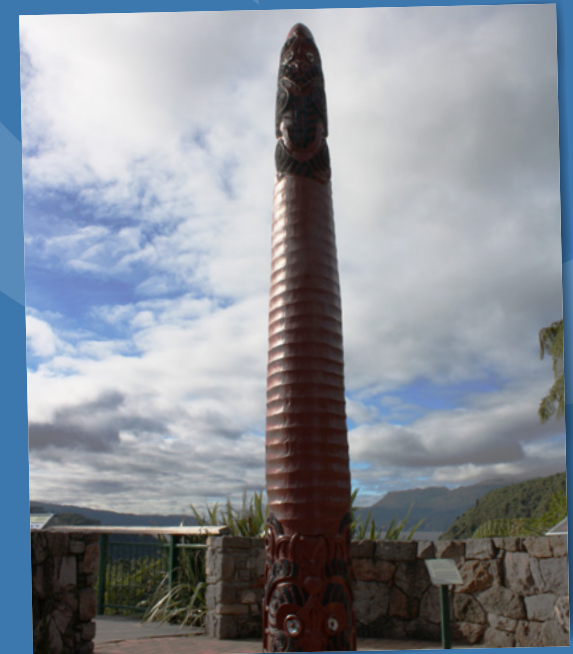
Viewing spot - Lake Tarawera