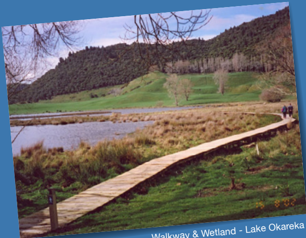
Walkway & Wetland - Lake Okareka