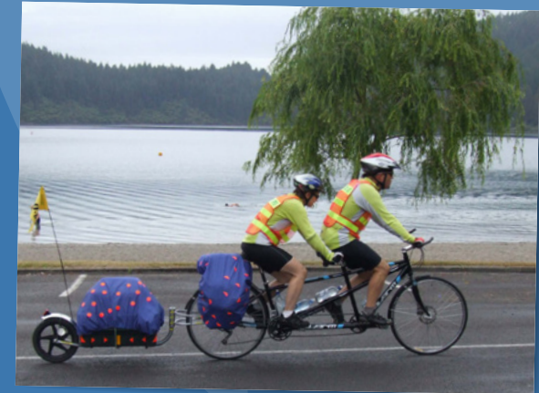
Cyclists - Lake Tikitapu