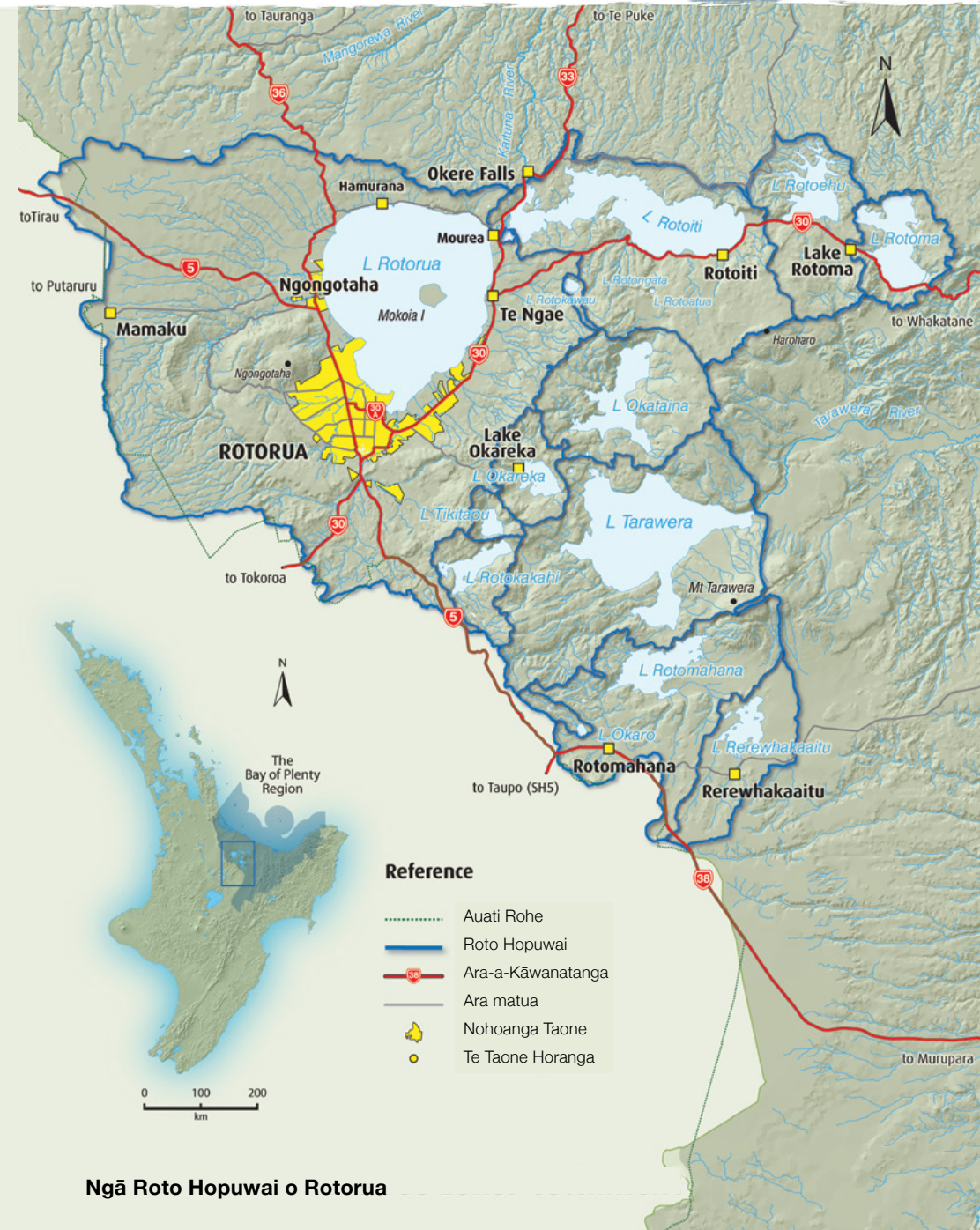
Ngā Roto Hopuwai o Rotorua