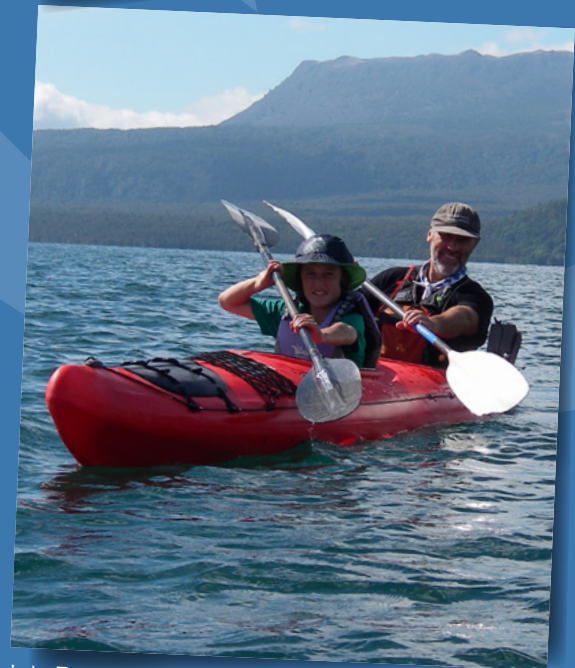
Lake Tarawera